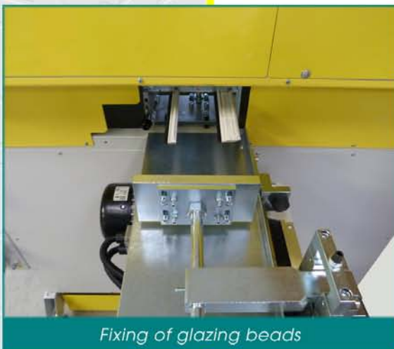
Fixing of glazing beads