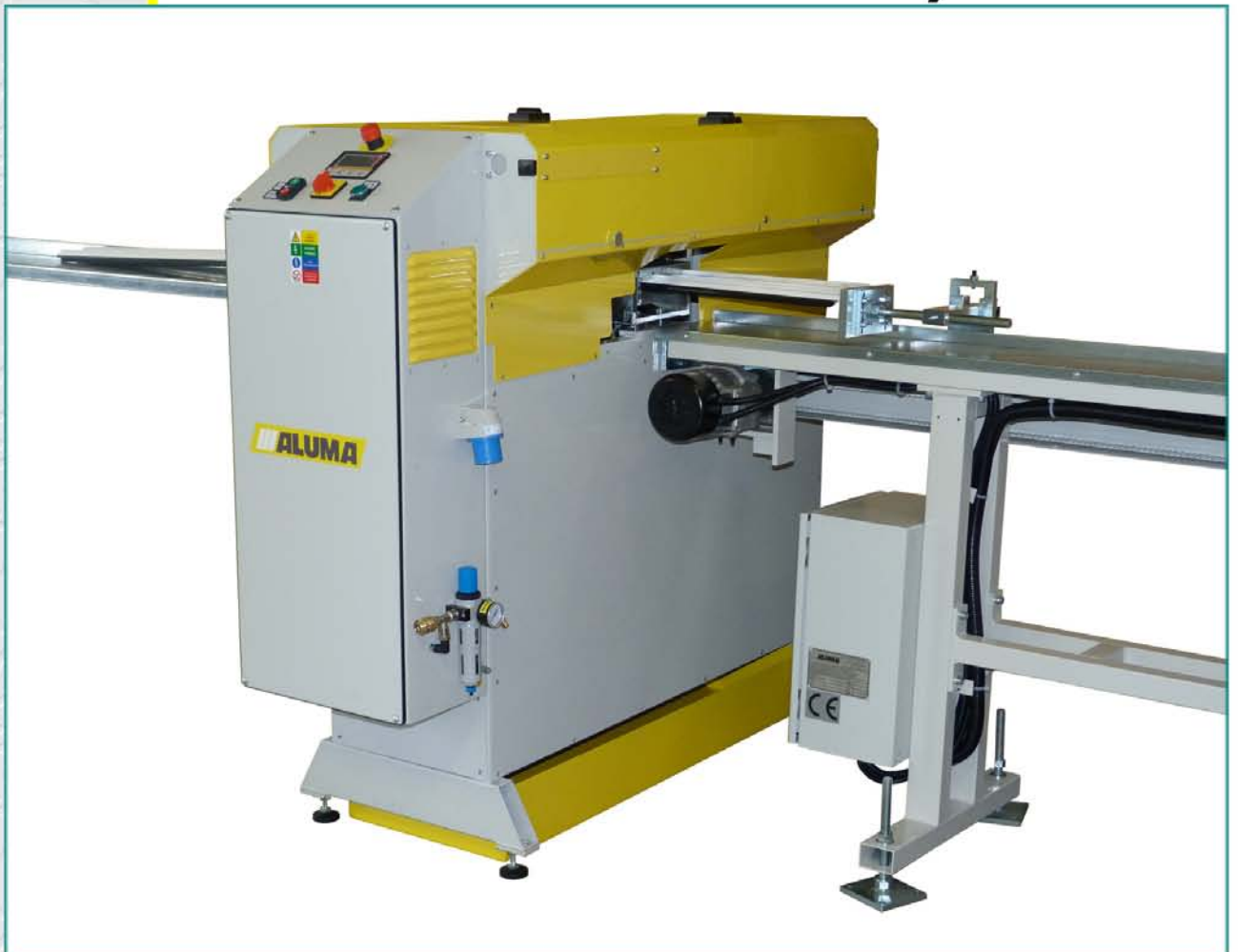
Glazing bead saw NOVA