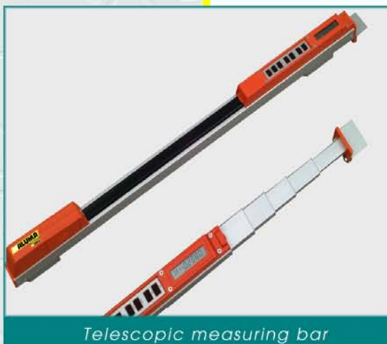
Telescopic measuring bar