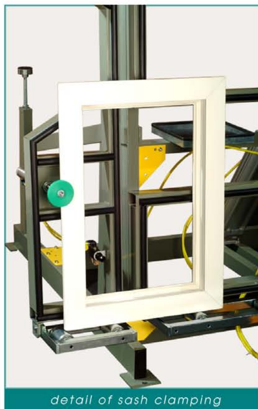
detail of sash clamping