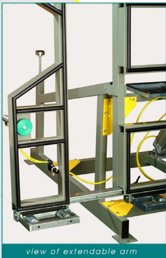
view of extendable arm