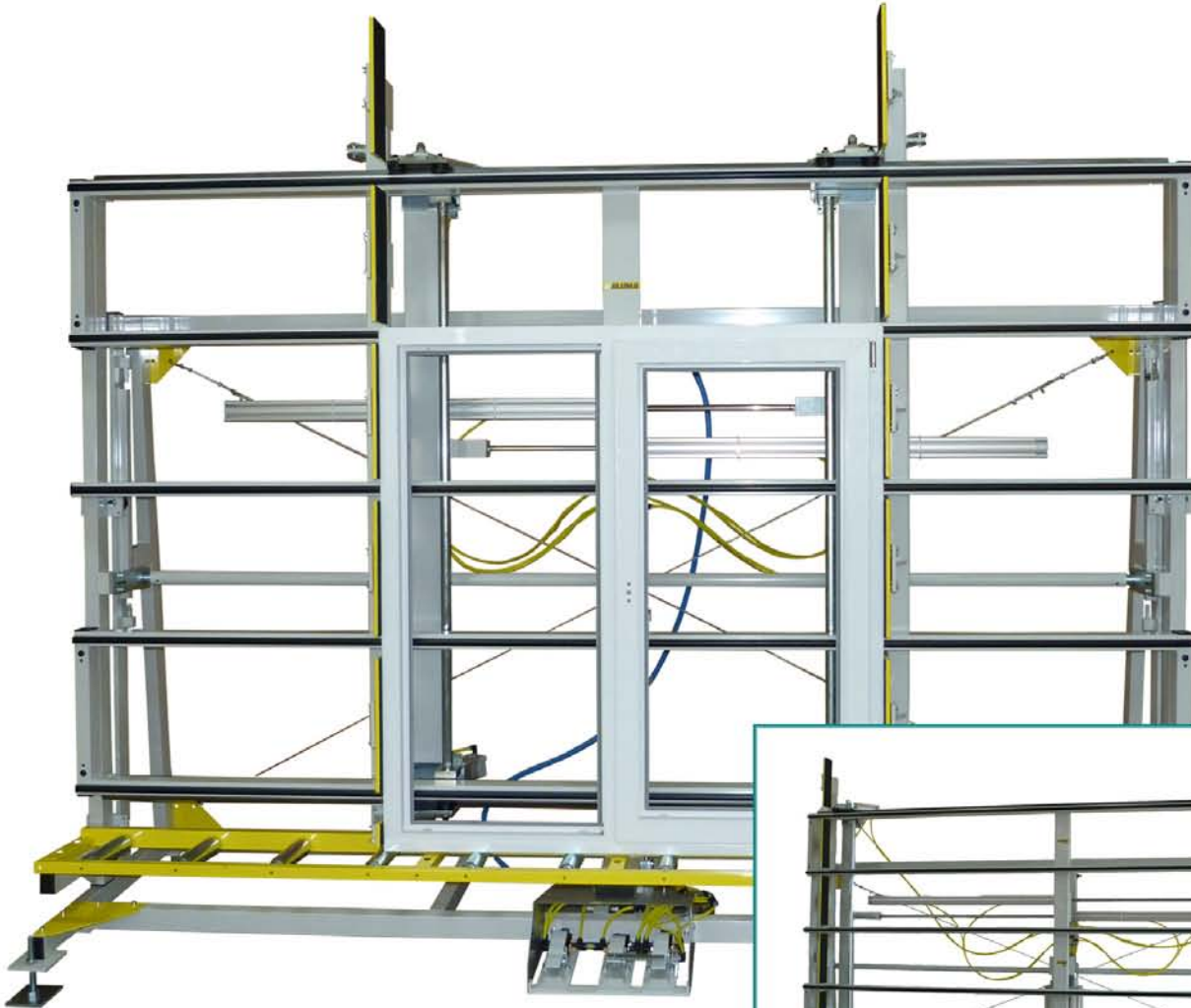
Checking and glazing unit FIXUS D