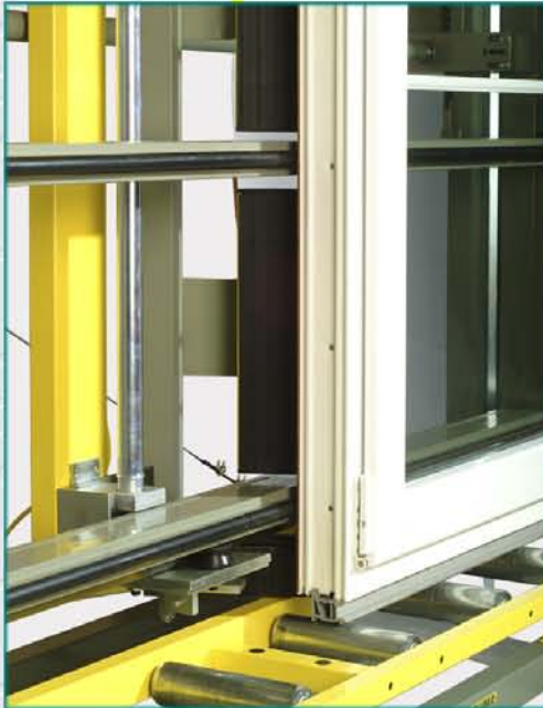
Retracted clamping bars