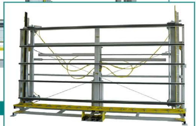
FIXUS D XL