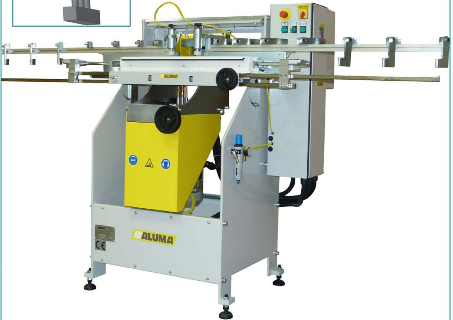
Drilling and Milling Automatic Machine PANTOMAT