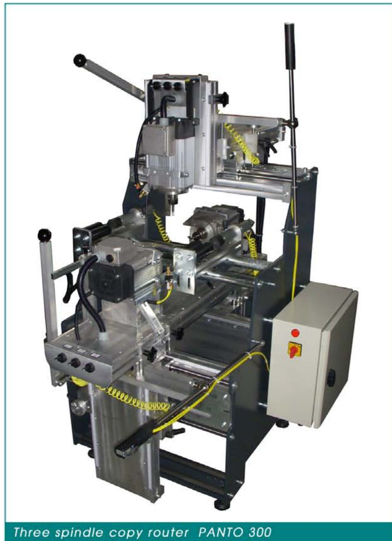
Three spindle copy router PANTO 300