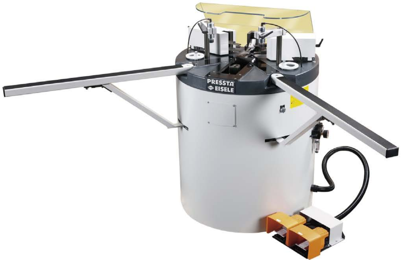
Corner crimping machine PRESSTA 5000