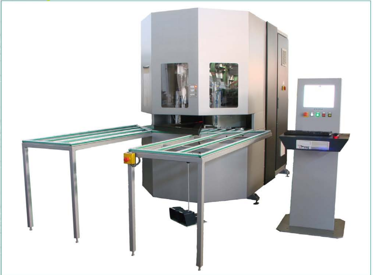
CNC corner cleaner APH-1LV