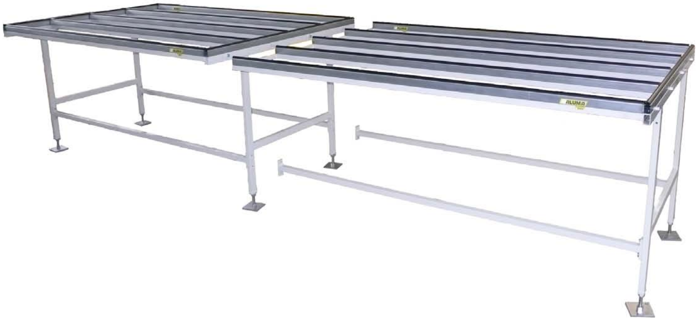
Assembly bench (basic + extension module)