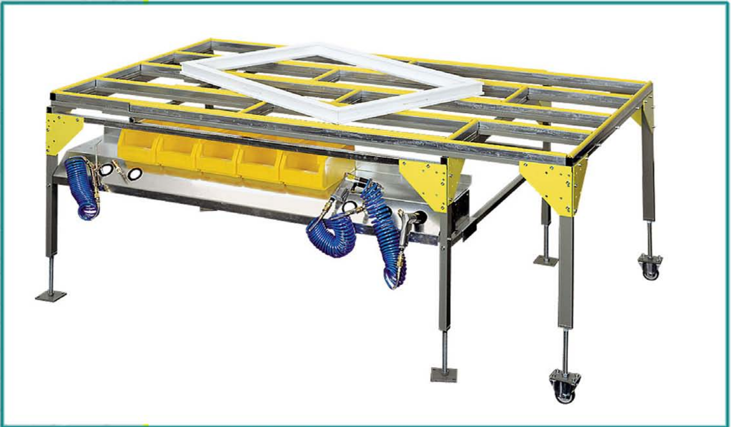
One side retractable assembly bench